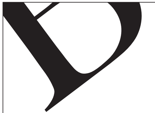
Bodoni | Clear, Neat