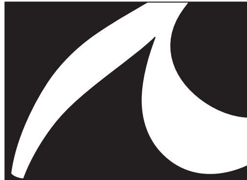
Arno Pro | Extends, Flowy