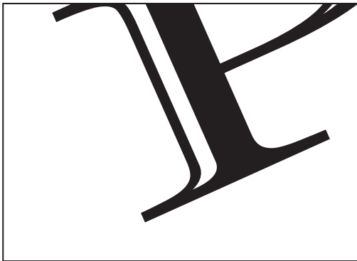
Imprint MT Shadow | Gothic, Painted